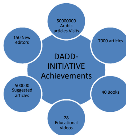
Figure 1: DADD-INITIATIVE achievements published in 2019